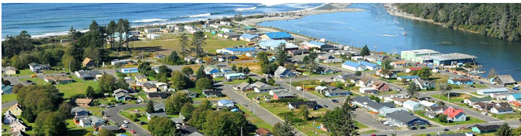
The Quinaults' ancestral village of Taholah is threatened by tsunamis and rising sea levels caused by global warming. Quinault Indian Nation

“The glaciers that feed the rivers and support the salmon that are integral to the Quinault culture and economy are disappearing,” tribal scientists say. “Forests on tribal lands are changing, and invasive species threaten critical subsistence resources. Ocean acidification, hypoxia events, sea level rise, coastal erosion, tidal surge and