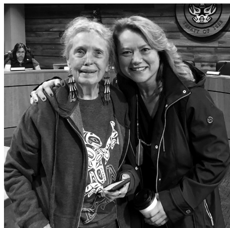
Sharp with legendary tribal activist Ramona Bennett of the Puyallup Tribe in 2018. They helped launch a political action committee to advance public policies that protect the environment and human rights. First American Project

The answer is that they died in salt water. The quake in 1700 abruptly lowered the land behind the beaches, turning a "forest meadow into a salt marsh." Atwater found the same evidence in other estuaries, all the way down to the Columbia. Each stream he studied "had the same signature of abrupt lowering of land and marshes and forests that had been at or above high-tide level" before the quake. He later learned that in the 1880s the Quinalts told white settlers there were once cedar groves along the mouth of the Hoquiam River. The river must have "eaten" them, the Indians said, because their bark was gone. "Hoquimts" was their word for "Hungry for wood."